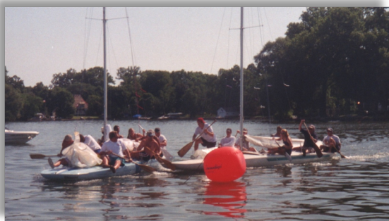
No wind, no problem.