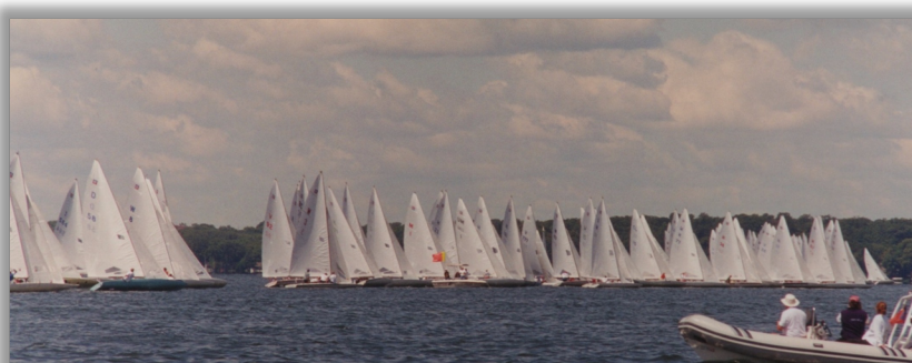
July 9, 1999. 130 boats on the line

Finding a home for 40 E-Boats is challenging, there's only so much space on the rail at Burrows Park! The Madison Parks Department stepped up and agreed to let boats launch from Tenney Park. Not just at the boat ramp, but also right off the beach. A deal was struck with the owner of the then-vacant WPS building across Sherman Avenue who offered his vast parking lot as