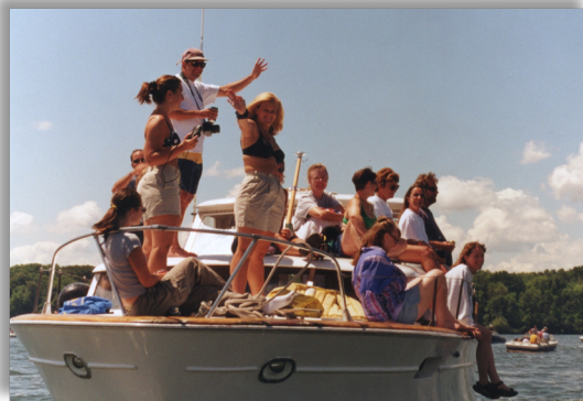
Spectators crowd the decks of the Four Play

Speaking of volunteers, we had dozens and dozens. MYC’ers from every fleet stepped up to build piers, launch boats, sell shirts, handle publicity, find safety boats and wrangle parties. “Club members called or came up to me at parties saying something like this: ‘I could help with ‘X’, or ‘if no one is doing it, I can organize it’. The regatta had no committee chairpersons assigned - everyone in the club just wanted to participate and be a part of something special. Volunteers just flooded the regatta venues – Burrows Park, Tenney Park, parking behind WPS, UW Hoofers, Kohl Center - in the weeks before the event and the following week for the cleanup. Remember, all those piers and breakwater cabling had to be taken down and put away. It was a team effort to be sure,” said Lon.